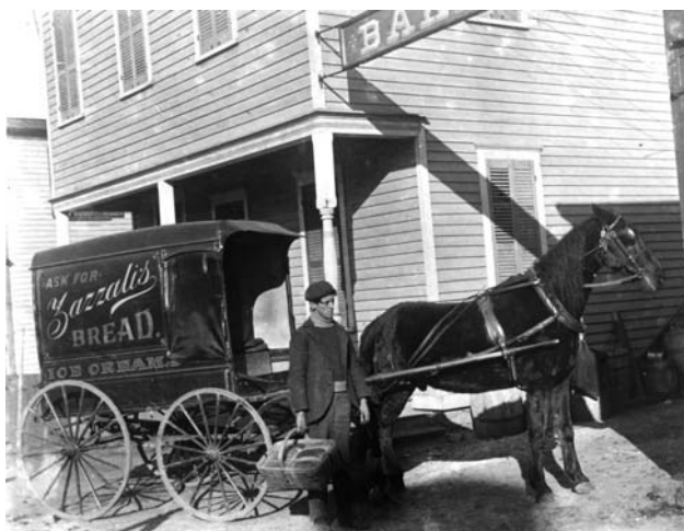
Zazzali Bread Company, Circa 1890 Princeton, New Jersey